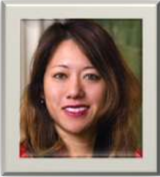
Asm. Fiona Ma

In November, 2006 Fiona Ma was elected to represent the people of California's 12th Assembly District. The district includes San Francisco, Daly City, Colma and Broadmoor.