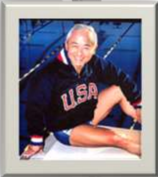
Dr. Sammy Lee